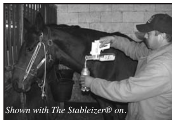
Shown with The Stableizer® on.

If an animal to be milked appears to become agitated or uncooperative with her handler during the extraction procedure or refuses to let her baby nurse, we recommend the use of The Stableizer® Restraint and Training system, originally developed for horses. This restraint system allows the animal to calm down humanely, providing a safer environment for both handler and baby. The calming effect will also aid the mother in letting her milk down.