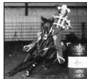
"The Stableizer® sure made a believer out of me, the immediate response is unbelievable."